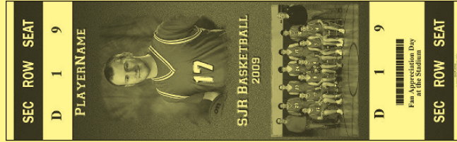
10" x 30" Gameday Poster