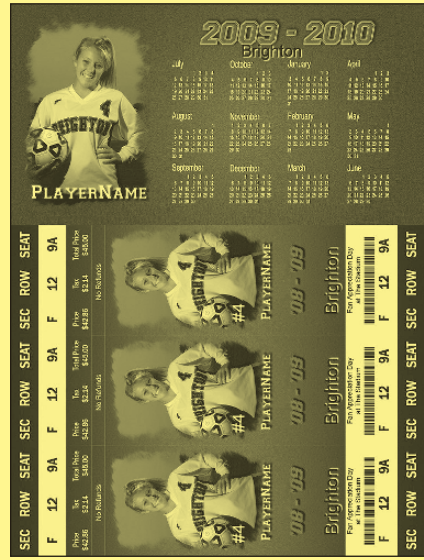
Gameday Tickets and Calendar